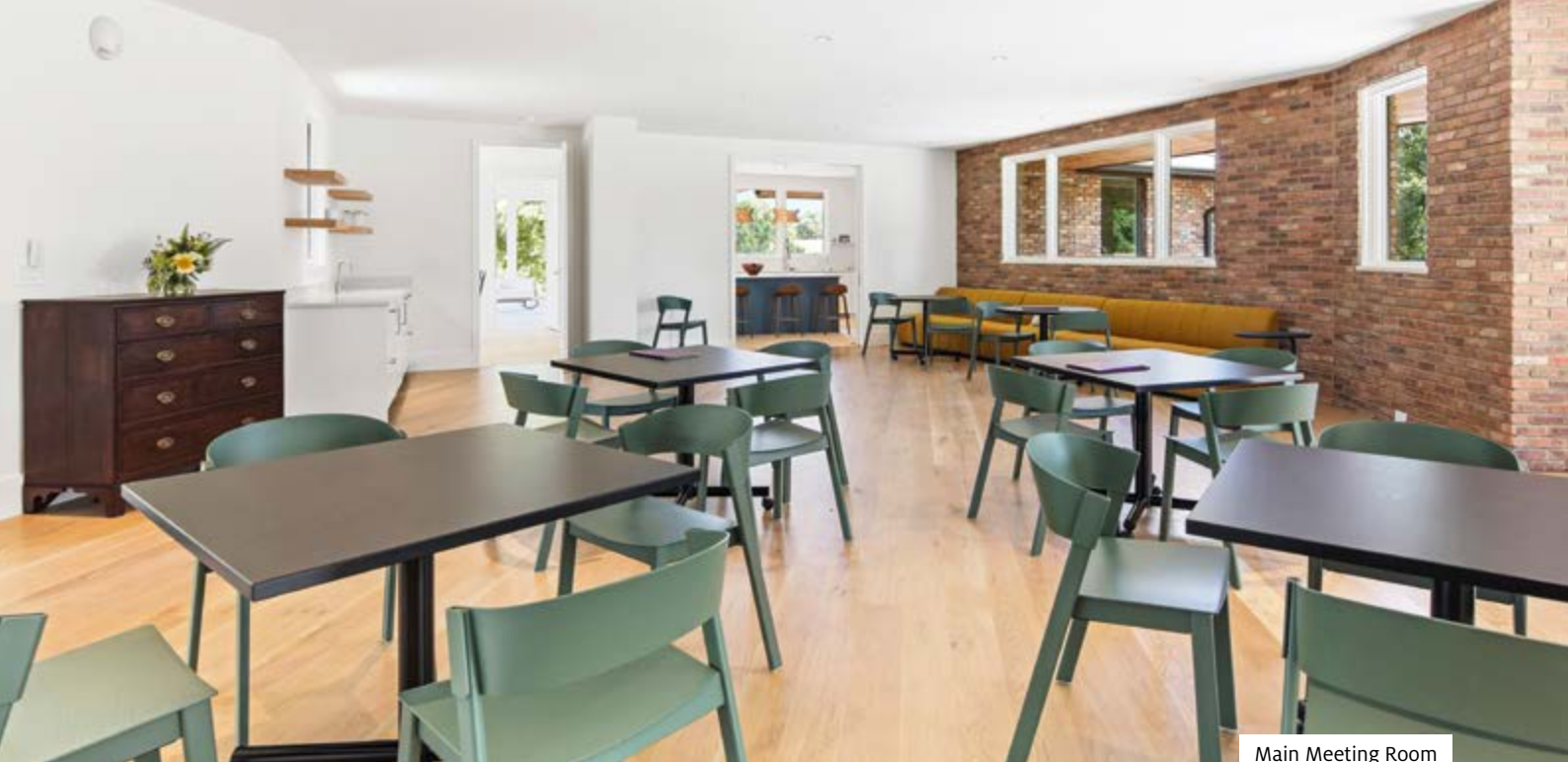
Main Meeting Room