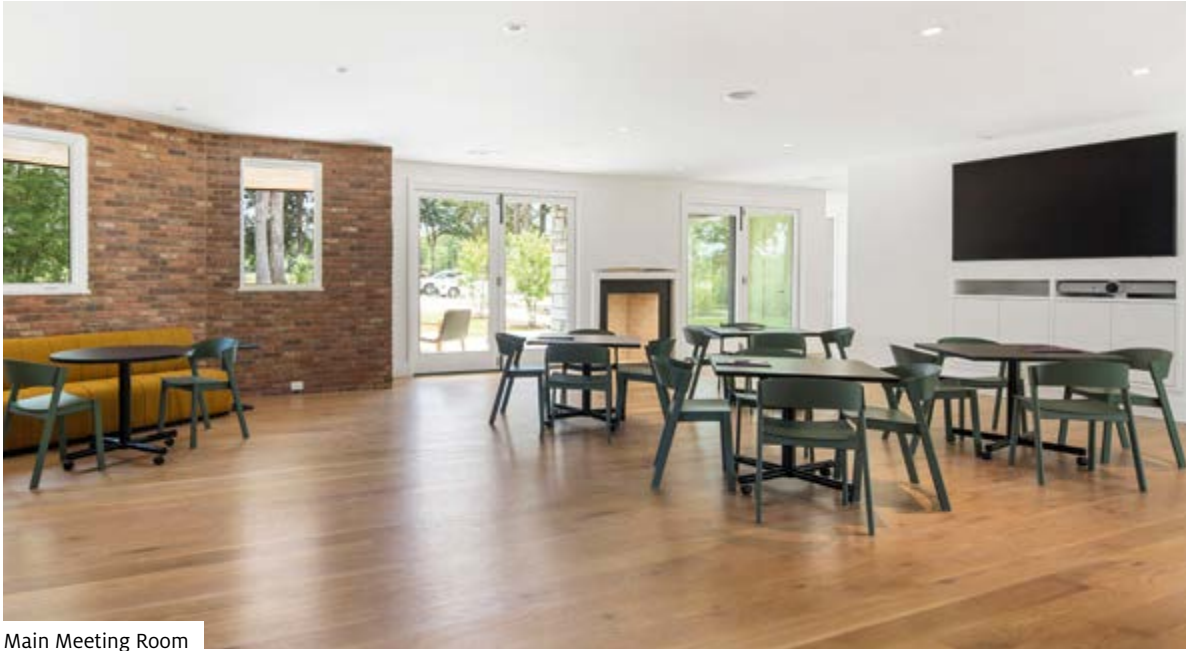
Main Meeting Room