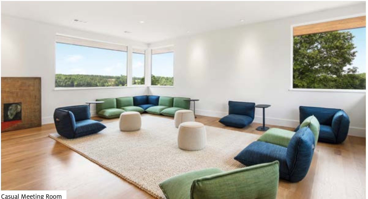
Casual Meeting Room