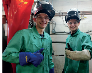
▲ German Azubis in Atlanta give their unique internship experience the "thumbs up" (2018)

Germany's dual vocational education system is an important and popular career path offering training in 325+ occupations including technical, business and other trades. This model sees participants simultaneously carry out both a paid apprenticeship with a company and classroom studies at a vocational school. It is this combination of training within companies and classroom-based education that gives the dual vocational educational model its name. Thanks to their exposure to both classroom learning and varied practical experience during the two to three years of their training, German apprentices are a highly-skilled workforce sought-after both in Germany and by companies around the world.