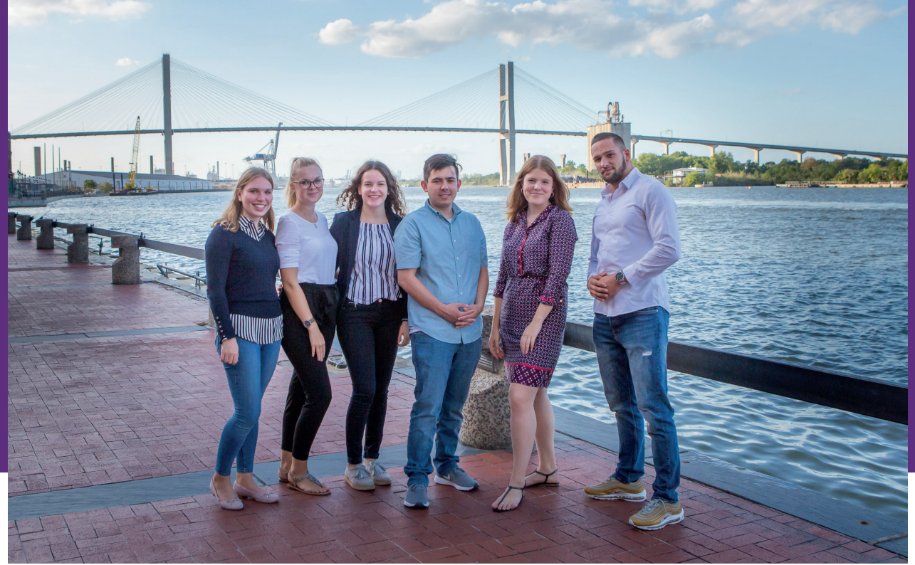
▲ German (logistics) Azubis at the Gateway of the Port of Savannah (2019)

on our website or contact us for information and advice: GATE - German Apprenticeship Training Exchange www.joachim-herz-stiftung.de/gate/en