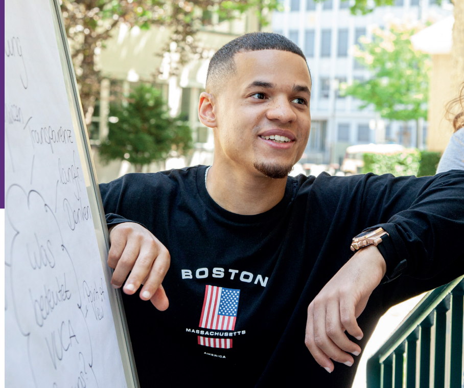
◀ "All smiles" from a young, German professional attending an international college program (2018)